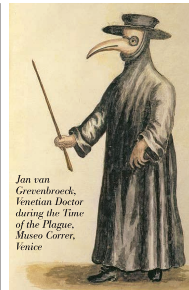
Jan van Grevenbroeck, Venetian Doctor during the Time of the Plague, Museo Correr, Venice

NEWS FOR MEMBERS AND SUPPORTERS WINTER 2021