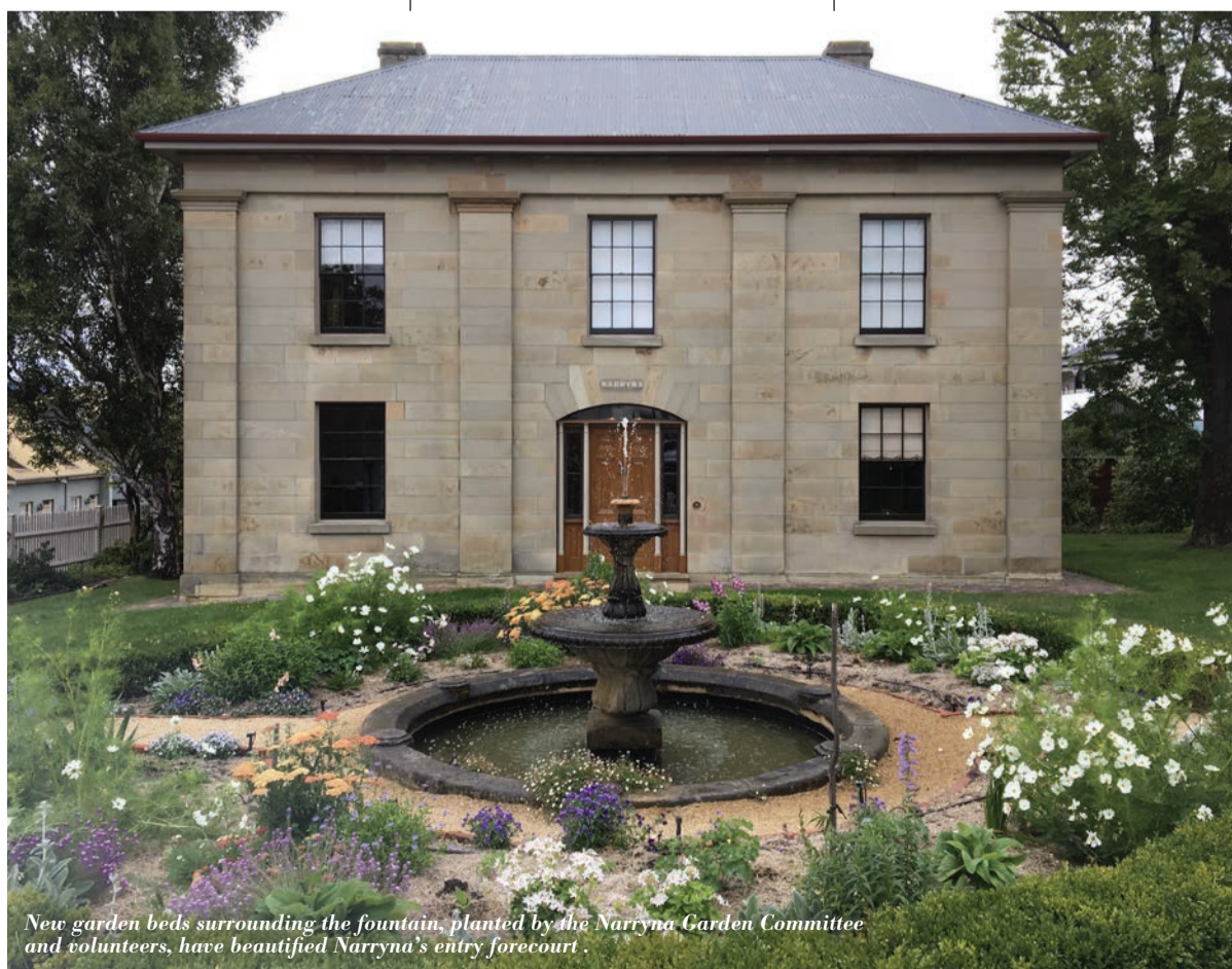
New garden beds surrounding the fountain, planted by the Narryna Garden Committee and volunteers, have beautified Narryna's entry forecourt.