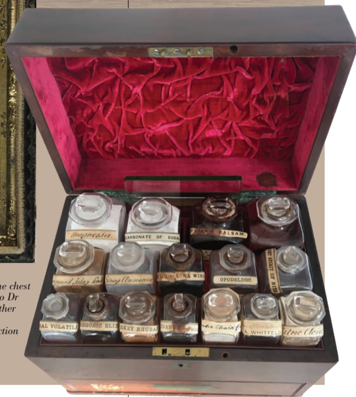
Right: Medicine chest provenanced to Dr William Crowther (1817-1885), Narryna collection